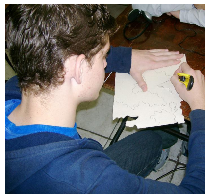
Figure 3. Mockup.